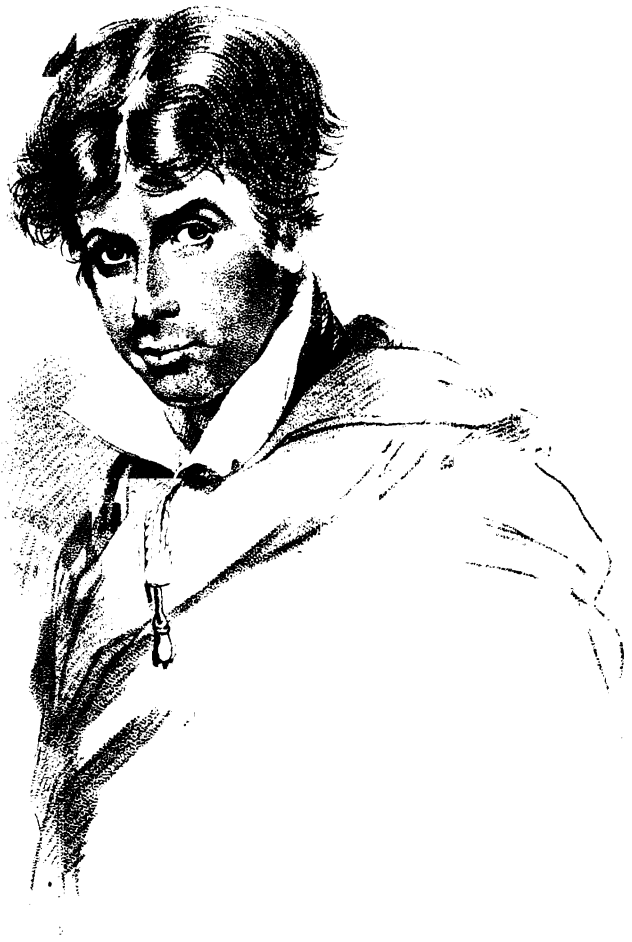
JAMES HENRY LEIGH HUNT